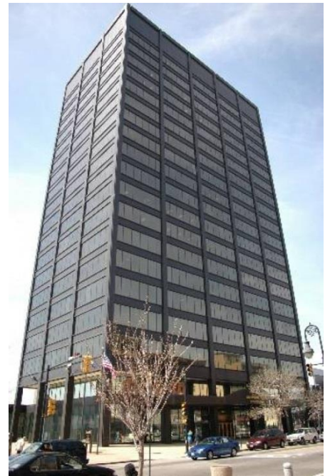
Below: The spectacular 24 Story Brady-Sullivan Tower in Manchester... the site of "LIVE UNITED Over the Edge 2018"