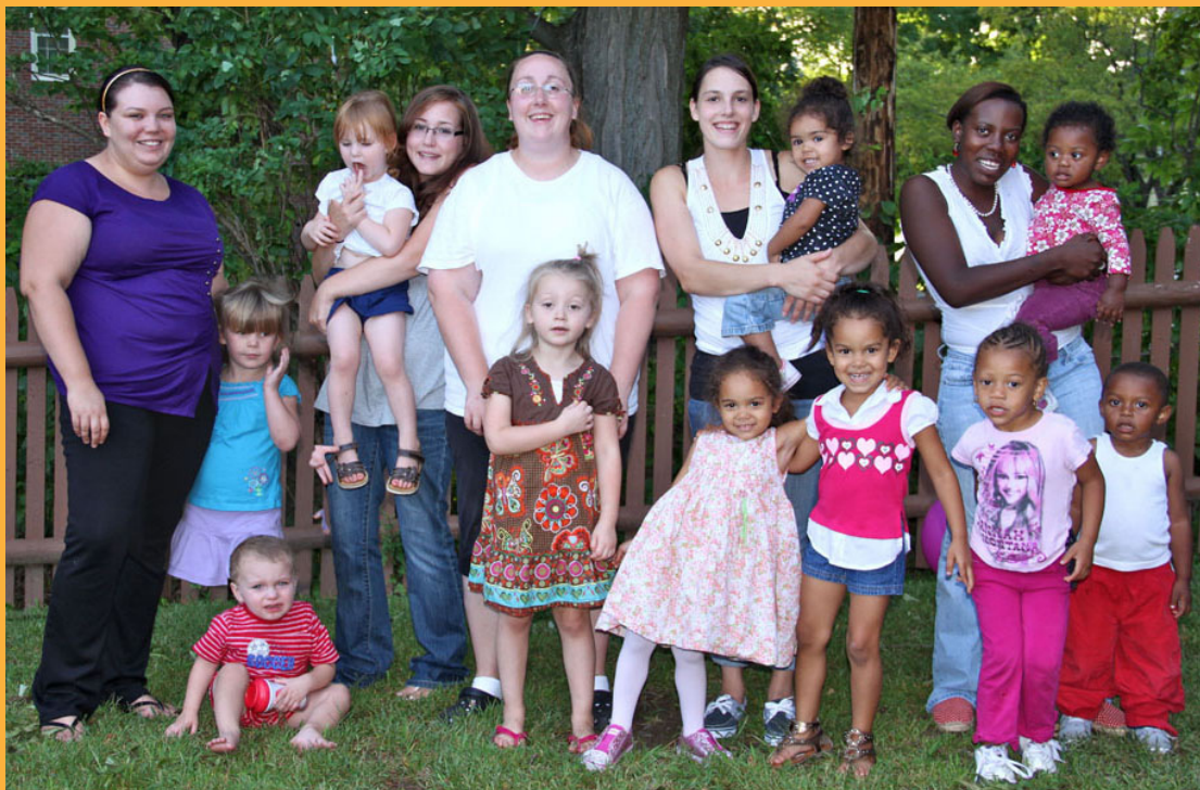
Some residents of the Nashua Pastoral Care Center’s Norwell House transitional housing program pose for a group photo.